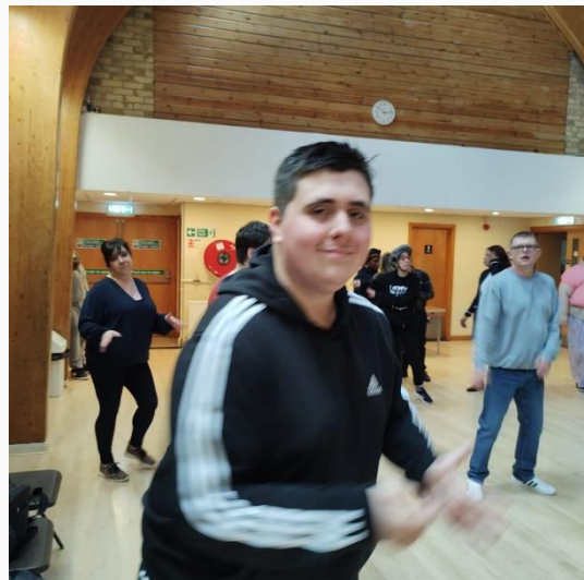
Sky Studios Elstree Talk