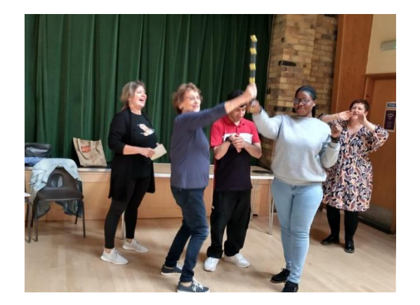
We had a super summer drama workshop in August. Everyone acted brilliantly and performed both in pairs and in group scenes.

We are looking forward to the return of Move to the Beat on Tuesday 3rd September and Drama on Thursday 5th September .