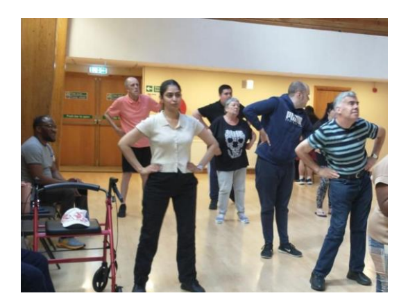
A buzzing August at Dance, we enjoyed dancing to Disney music and party tunes.